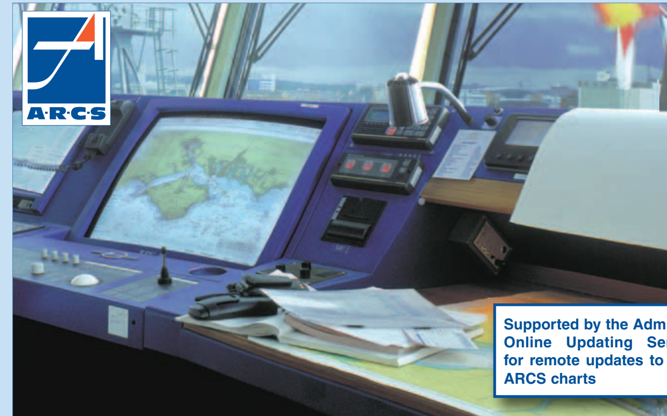
Typical ARCS bridge display

The Admiralty Raster Chart Service (ARCS) offers the mariner an exact digital reproduction of the Admiralty paper chart for use within electronic navigational systems (see pages 9-10). Charts are supplied on regional CD-ROMs and are accessed via electronic permit keys.